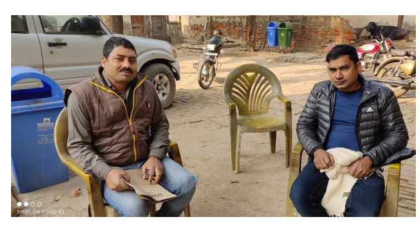
A field Investigator interviewing the Gram Pradhan (Dhaurhara)