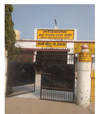
Gram Panchayat office (Undla Jagir)