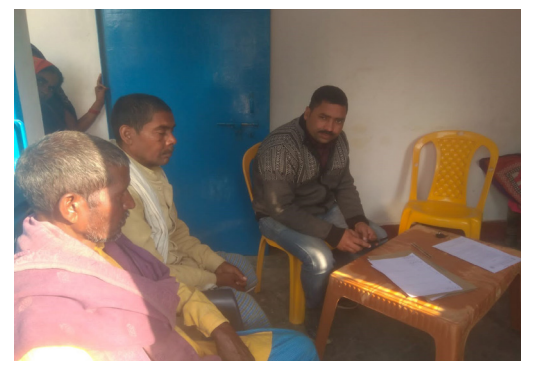
A field Investigator interviewing the locals