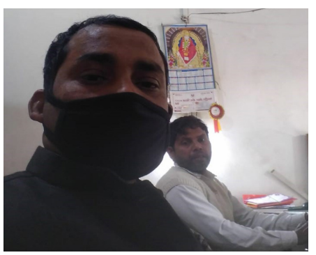
A field Investigator interviewing a local