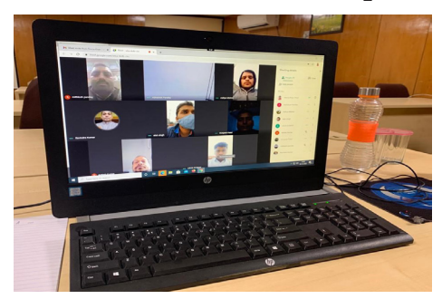
An online meeting with the Field Investigators