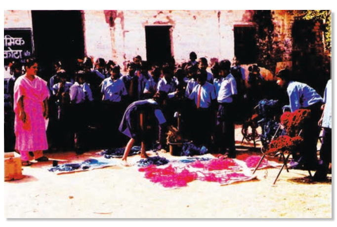
बाल श्रमिक विद्यालय बिल्हा बिलासपुर (छ० ग०) छात्र/छात्राओं को गणवेश वितरण वर्ष 2012-13