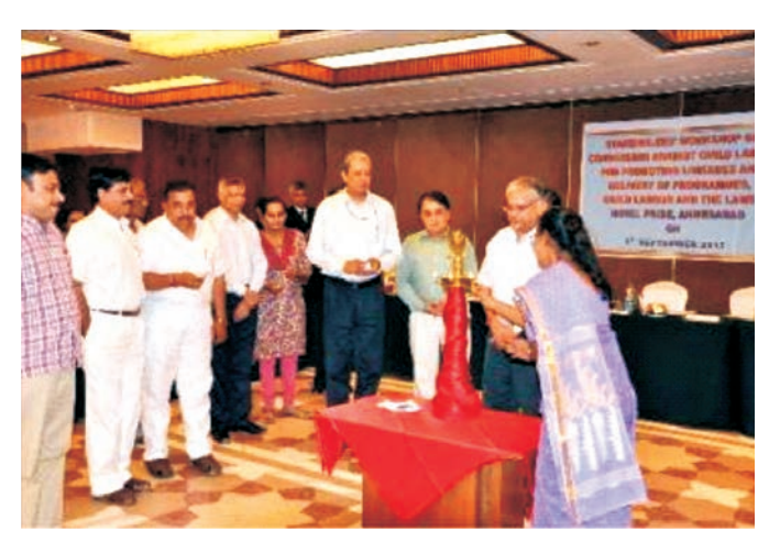
Stakeholders Training Workshop, Ahmedabad

The SRC, Gujarat also organized two sensitization workshops for the Judiciary involving 110 Judicial Magistrates on child labour issues.