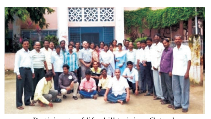
Participants of life skill training, Cuttack

The NCLP society, Cuttack organized awareness camps through Participatory Rural Appraisal (PRA) to inform and encourage potential adolescent beneficiaries and their families in Athagarh, Baramba, Tigiria, Niali, Salepur, Kantapada, Cuttack Sadar, CMC and Choudwar Municipality areas to enrol in the skills trainings provided under SDI–MES scheme. The Society also conducted camps to break gender stereotypes that prevent adolescent girls from enrolling in skills trainings and/or enrol for training courses in non-traditional occupations/trades. The camps also worked to ensure equal participation of girls and boys in the skills training initiative.