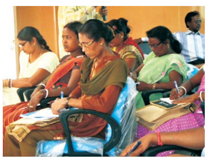
PRI members sensitised on the issue of child labour

to bring down the incidence of child labour to a certain extent. However, more efforts need to be made to eliminate the problem completely. There is a need to create more awareness on the legal provisions. He also requested the PRI members to extend their support to make the state child labour free by ensuring the effective implementation of Govt. schemes and policies.