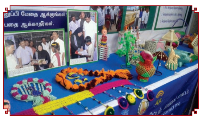
National Child Labour Project (NCLP), Jalandhar, Punjab