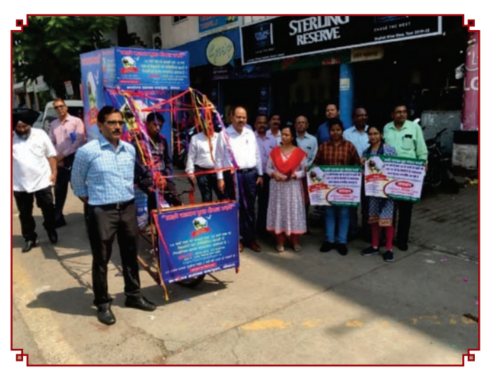
National Child Labour Project (NCLP), Kanchipuram, Tamil Nadu