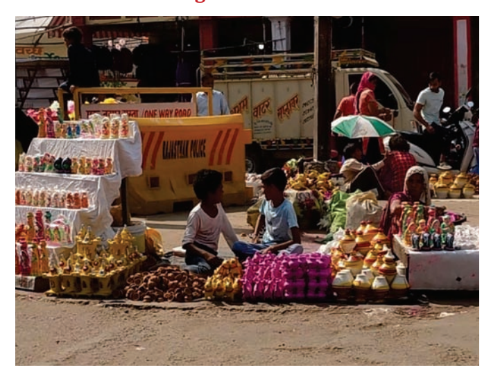
Figure 2: Child Vendors in the town-market, Alwar during Diwali festival