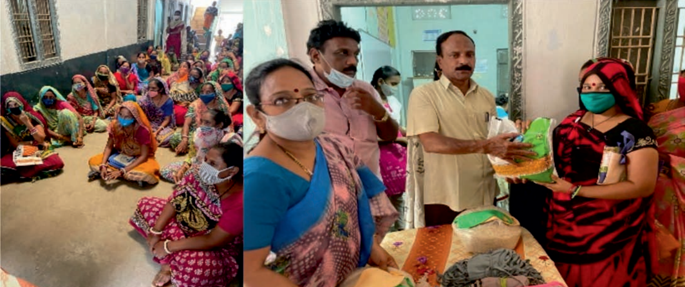
Awareness Programme on Corona and distribution of Pulses and Masks