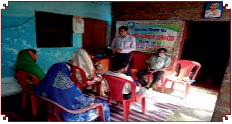
Teacher's Day Programme in Special Training Centres (STCs)