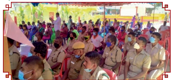
Special health check up and Awareness Generation