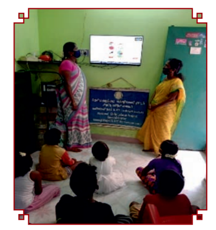
STC Children attending classes