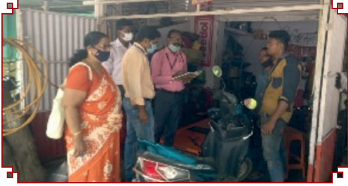
Identification of Child labour