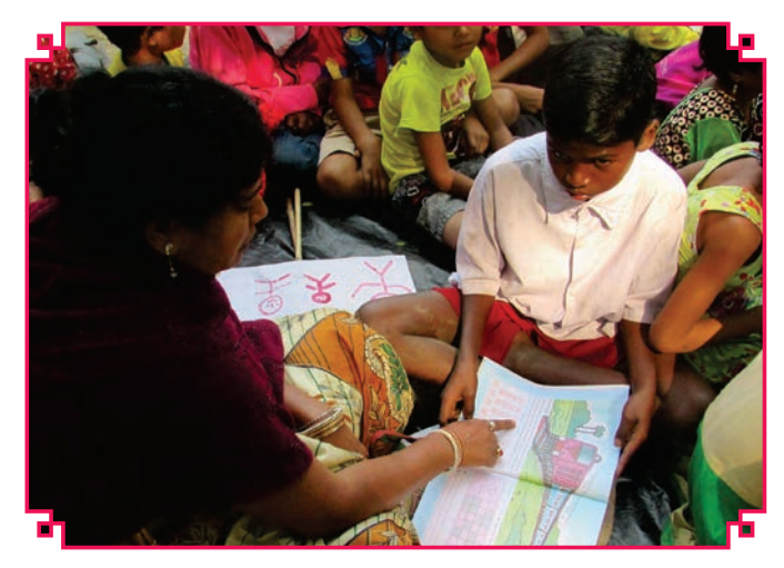
Rescued Child labourers are provided Education