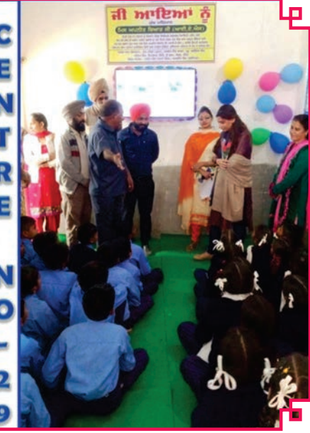
"Smart Class Room Programme" initiated by Naujwan Social Cultural Welfare Society, at NCLP Ludhiana