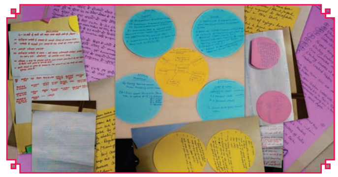
Group work and presentations in VIP Cards on District-specific issues in Child Labour Rehabilitation