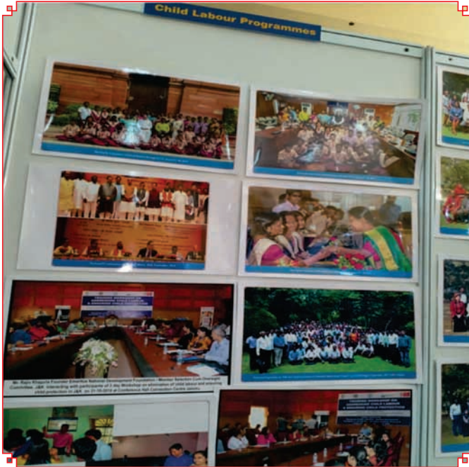
Exhibits of Child Labour Elimination Activities by VVGNLI at the Exhibition on 'Rise in Jammu'