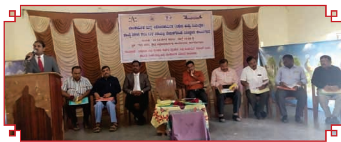
National Child Labour Project, Jalna, Maharashtra